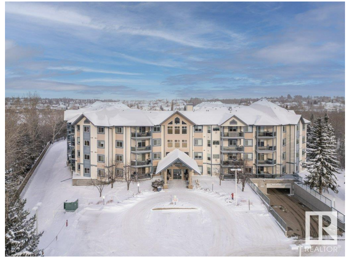
414-100 Foxhaven Dr, Sherwood Park, AB