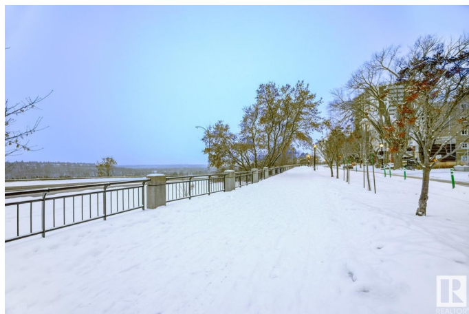
1701-11710 100 Ave NW, Edmonton, AB